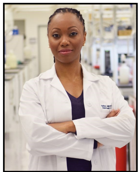
Dr. Hadiyah-Nicole Green leads research that explores lasers in cancer treatment.

GMaP Region 2 looks forward to continuing to highlight the accom-