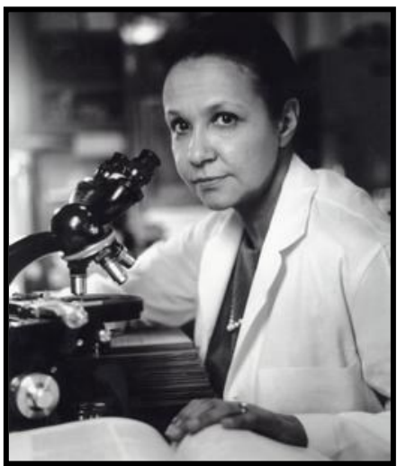
Dr. Jane Cooke Wright, well-known trailblazer in cancer research.

Throughout the course of American history, Black people have played an integral role in advancing cancer research. This is evident through the contributions of influential physician-scientists like Dr. Jane Cooke Wright. Dr. Wright earned a full scholarship to study medicine at New York Medical College. After graduating with honors from an accelerated 3-year program in 1945, she joined her father, Dr. Louis T. Wright, at the Cancer Research Foundation at Harlem Hospital, where they researched chemotherapy treatment modalities. Over the course of her more than 40 year career, she published more than 100 articles and became the first Black