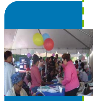
Women register for their mammograms as part of the San Jose Mission's health fair held on March 29, 2006.

The weekend of May 12-14, the Faces of Courage Foundation held their second annual African American Women's Cancer Retreat at the Rotary Camp Florida in Brandon. The camp was open to women of color whose lives have been touched by any type of cancer. This year 67 women attended the retreat. Holding true to the foundation's motto, "Cancer is serious, camp is serious fun," the camp was held in true Faces of Courage