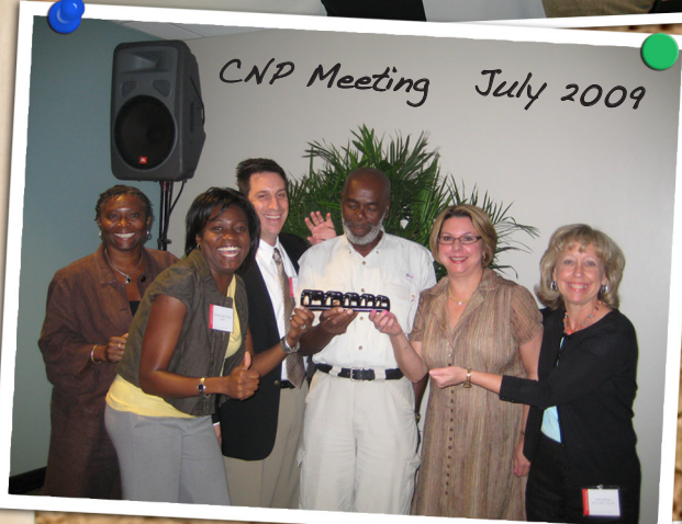
CNP Meeting July 2009