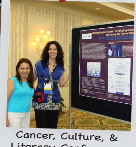
Cancer, Culture, & Literacy Conference May 2008