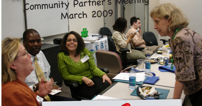
Community Partner's Meeting March 2009