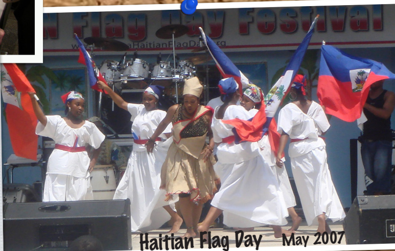
Haitian Flag Day May 2007