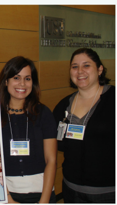
Community Partner's Meeting May 2009