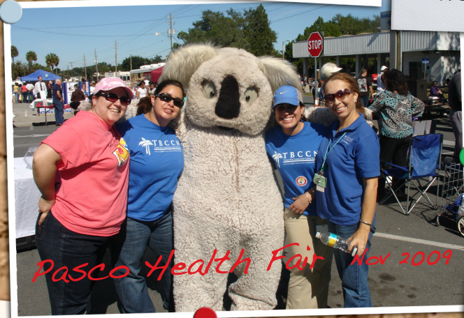
Pasco Health Fair Nov 2009