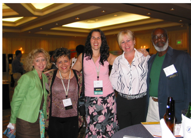
Cancer, Culture, & Literacy Conference May 2006