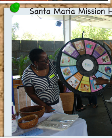
Santa Maria Mission H