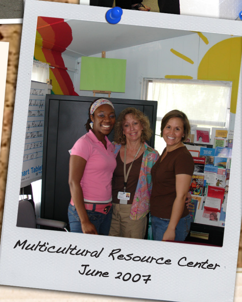
Multicultural Resource Center June 2007