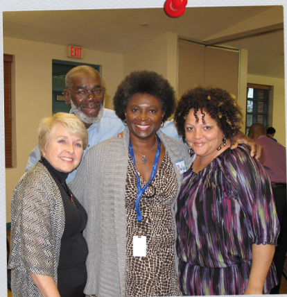
Community Partner's Meeting December 2009