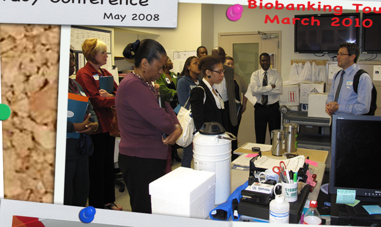
Biobanking Town Hall March 2010