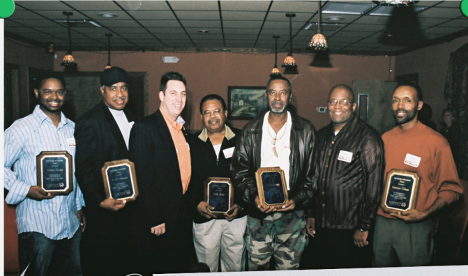
Barbershop Capstone Dinner October 2008