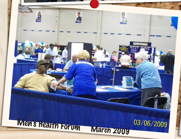
Men's Health Forum March 2009 03/06/2009