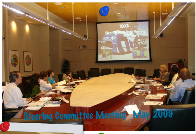
Steering Committee Meeting May 2009