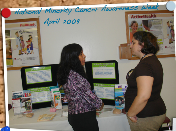
National Minority Cancer Awareness Week April 2009