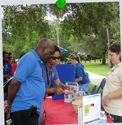
Head Start Picnic July 2009