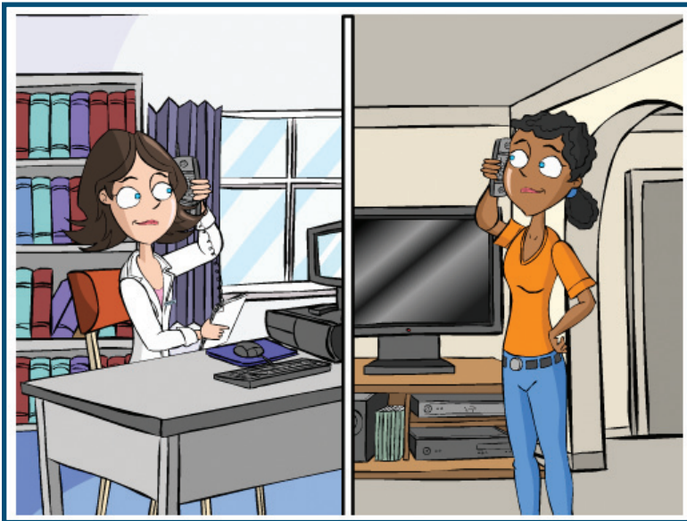
Screenshot of the interactive 4B curriculum

Previous research conducted with IFRs, vulnerable community members, and biomedical and biobehavioral researchers provided the framework for identifying researcher learning preferences and key domains for the development of case studies. Five curriculum domains were identified: 1) privacy and confidentiality, 2) communication of personal results, 3) communication of overall results, 4) informed consent, and 5) community mistrust and fear of cloning and genetic research. Case studies with supplemental dialogue animation and post-assessment questions were created for each of these domains and hosted on a Project 4B website. The curriculum also includes definitions, a collection of relevant publications, and other resources for legal information or biobanking repositories.